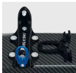
Adapter for crampons

The front part of the binding also contains a slot for an adapter for crampons . The adapter is not included in the package. Use only the original GRIZZLY.SKI adapter for this binding model.